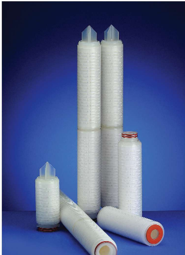
Opti-Clear Series: High surface area pleated cartridges with microporous cellulose membrane